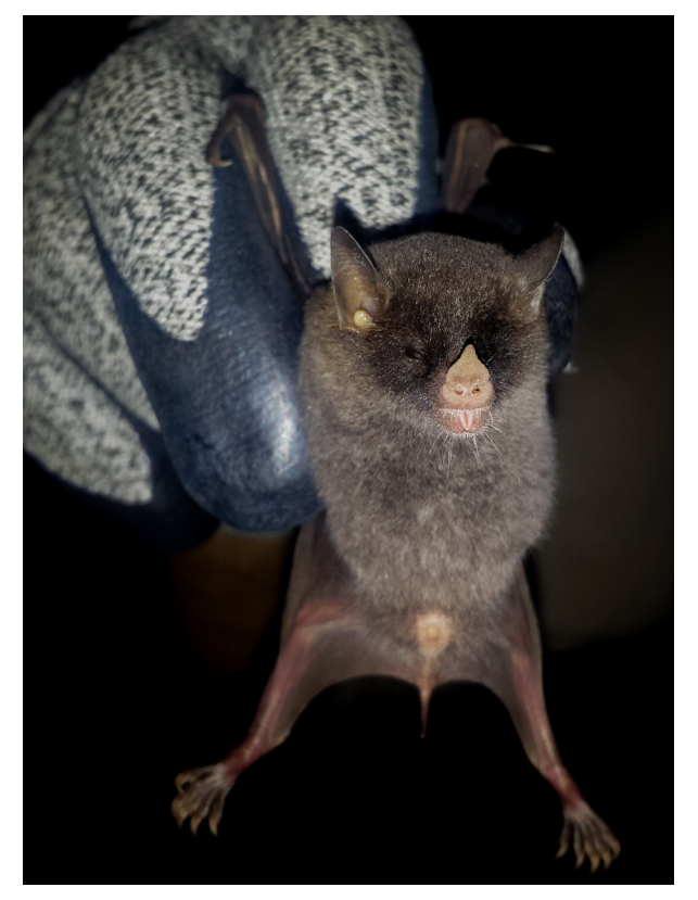
Figure 3. Photograph of a female Monophyllus plethodon , which was the first individual of this species captured on St. Eustatius. This bat was taken at the edge of the crater of The Quill. Note the elongated rostrum, simple noseleaf, and presences of a tail characteristic of this species.

On this evening the Dutch Team set a 3-m net at a height of 5 m in the middle of the hiking trail from Yellow Rock where it comes near to the edge of the crater of The Quill, and a 7-m net was placed at a right angle to the 3-m net along the rim of the crater. These nets were undoubtedly set near where the American Team