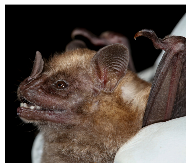
Figure 5. Photograph of a male Artibeus jamaicensis from swimming pool of the Kings Well Resort on the island of St. Eustatius. Note the large nose-leaf, white stripe over the eye, and brown coloration, all characteristic of this species.

Hispaniola, Puerto Rico, St. John, and Dominica (Genoways et al. 2001). P. Larsen et al. (2007) included 10 individuals of A. jamaicensis collected from St. Eustatius in their phylogenetic analysis of the Artibeus jamaicensis complex. Their results show a single mitochondrial cytochrome-b haplotype shared among the 10 individuals and this haplotype was also shared with individuals collected from a wide geographical distribution, ranging from Quintana Roo, Mexico, eastward to Jamaica and Puerto Rico, throughout the northern Lesser Antilles, and as far south as Carriacou in the Grenadines. The results of P. Larsen et al. (2007) support the hypothesis of a recent Caribbean colonization by A. jamaicensis (perhaps within the last ~25,000 years) originating from Central American populations and expanded rapidly to the east across the Greater Antilles and Lesser Antilles. Carstens et al. (2004) identified a similar lack of genetic variation across the northern Lesser Antilles; however, their analyses also identified three A. schwartzi mitochondrial haplotypes on the islands of Montserrat, Nevis, and St. Kitts (see P. Larsen et al. 2007 and P. Larsen et al. 2010). The existence of A. schwartzi mitochondrial haplotypes circulating in northern Lesser Antillean populations of A. jamaicensis provides evidence of historical or ongoing hybridization (P. Larsen et al. 2010). Moreover, this observation suggests gene-flow from southern