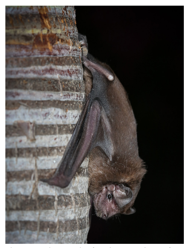
Figure 7. Photograph of Molossus molossus from swimming pool of the Kings Well Resort on the island of St. Eustatius. Note the short, rounded ears, nearly naked face, and chestnut-black coloration characteristic of this species. The tail that is free beyond the edge of the uropotagium, characteristic of all bats of the family Molossidae, is difficult to see between the feet of this individual.

Remarks. —This common "house bat" is widely distributed throughout the archipelago and was expected on St. Eustatius (Fig. 7). Koopman (1968) first reported specimens of this species from St. Eustatius without reference to specific specimens or localities. Husson (1962) restricted the type locality of M. molos sus to the island of Martinique, which led Dolan (1989) based on morphometrics to apply the name M. m. molossus to this species throughout the Lesser Antilles. Lindsey and Ammerman (2016) included specimens