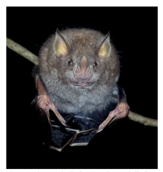
Figure 6. Photograph of a female Ardops nichollsi from the edge of the crater of The Quill on St. Eustatius. Note the large, complex nose-leaf, the white shoulder spot that is visible above the left wing, and the long, grayish pelage characteristic of this species.

Remarks. —Previously, Jones and Schwartz (1967) recognized five subspecies of Ardops nichollsi , where the subspecies montserratensis was comprised of individuals of Ardops nichollsi from Montserrat and St. Eustatius (Fig. 6). Subsequently, this subspecies was reported from Saba (Genoways et al. 2007a), St.