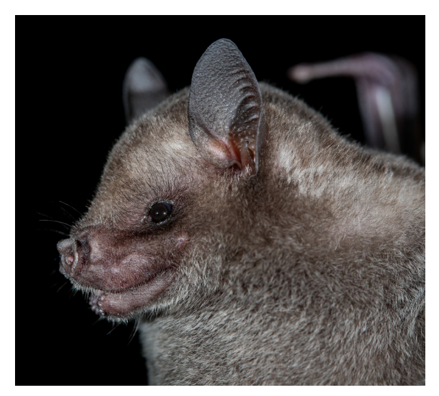
Figure 4. Photograph of a female Brachyphylla cavernarum taken from a mango tree near the F. D. Roosevelt Airport on the island of St. Eustatius. Note the greatly reduced nose-leaf and gray coloration characteristic of this species.

Martinique confirming the placement of St. Eustatius individuals in the nominate subspecies. Individuals from St. Eustatius and Barbuda averaged among the largest in measurements for the subspecies. Carstens et al. (2004) examined the genetic structure of northern Lesser Antillean populations of B. cavernarum, and they included two individuals collected from St. Eustatius in their analyses. Their results showed low genetic diversity (within the mitochondrial cytochrome-b gene) across the islands of St. Maarten, St. Eustatius, Saba, Nevis, and Montserrat. The two individuals examined from St. Eustatius differed by a single nucleotide in cyt-b sequences and these haplotypes were identified on neighboring islands (Carstens et al. 2004). Despite the lack of genetic structure observed in cyt-b gene variation, we recommend additional genetic analyses, perhaps using advanced genetic approaches appropriate for population-level genetic resolution (for example, high-throughput Restriction site Associated DNA Sequencing; RAD-seq), of Caribbean populations of B. cavernarum.